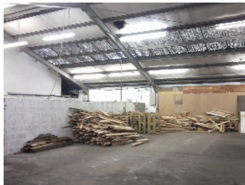
Energy Performance Asset Rating